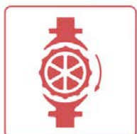
WAS2 SIGN - FB 6 Sprinkler stop valve