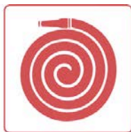
WAS2 SIGN - FB 3 Fire hose