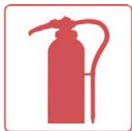
WAS2 SIGN - FB 2 Fire extinguisher