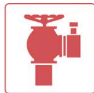
WAS2 SIGN - FB 4 Fire hydrant