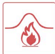
WAS2 SIGN - FB 9 Location of fire blanket