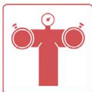
WAS2 SIGN - FB 8 Fire pump connection