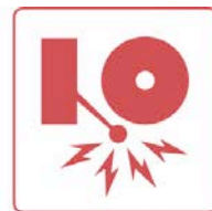
WAS2 SIGN - FB 5 Fire alarm