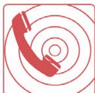
WAS2 SIGN - FB 7 Fire telephone